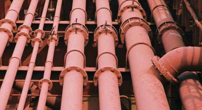
Image: Deck cargo piping on a tanker