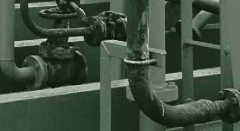
Image: Ballast, air and cargo piping arrangement