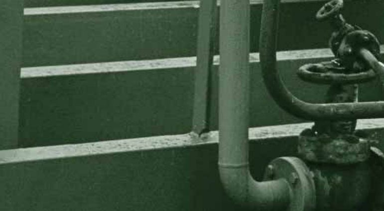
Image: Deck piping