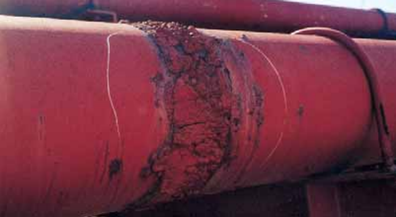
Image: Pipe corrosion