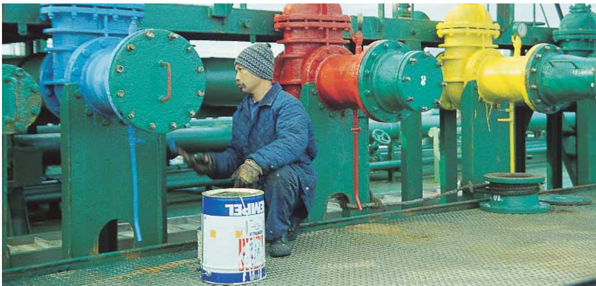
Image: Colour-coding cargo pipes

Accelerated corrosion can occur in steam piping fitted to the decks of tankers. If pipes are insulated, and the insulation gets and stays wet, any corrosion is accelerated. Table 3 on page 17 shows optimum corrosion allowances for various types of pipe.