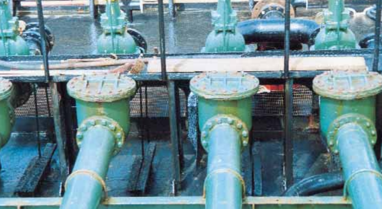
Image: Manifolds, filters and valves