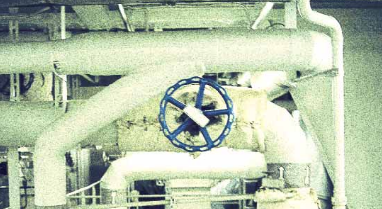
Image: Steam pipes