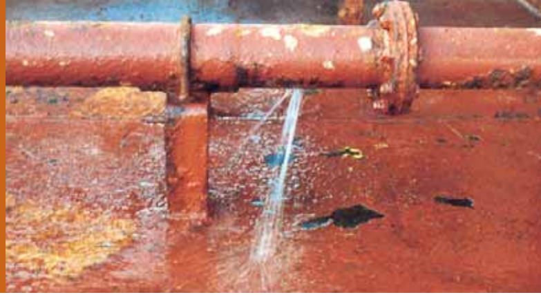
Image: Leaking fire main