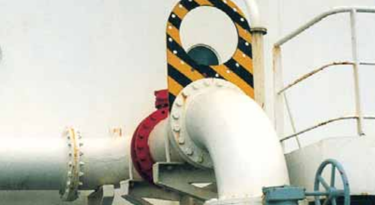
Image: Spectacle flange