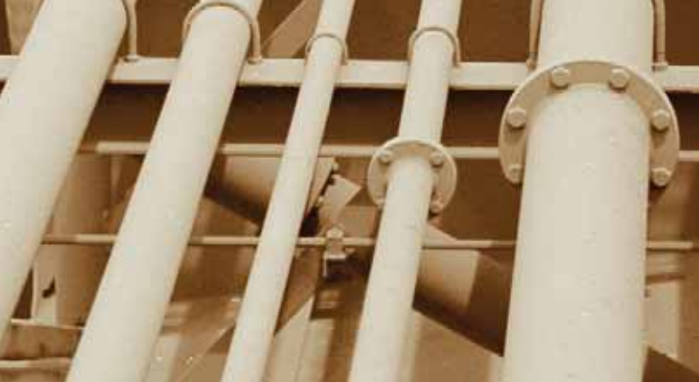
Image: Pipes come in different sizes