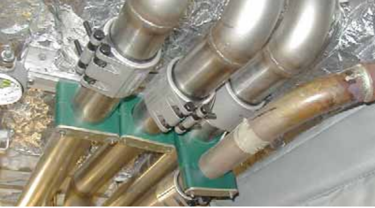
Image: Pipes with grip-type joints