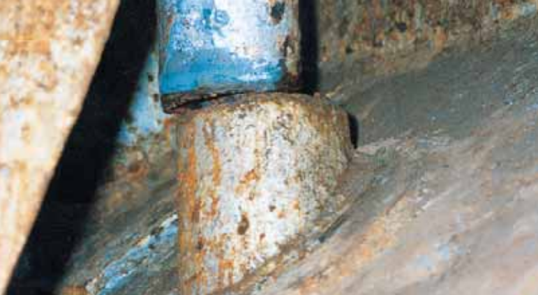
Image: Misaligned air ventilation pipe