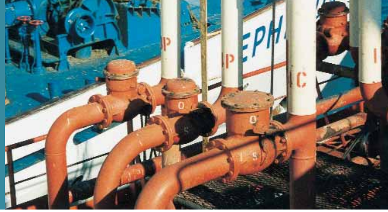
Image: Ventilation pipes