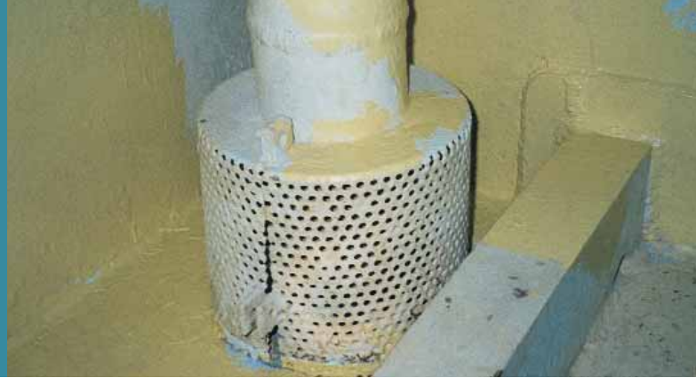
Image: Suction filter